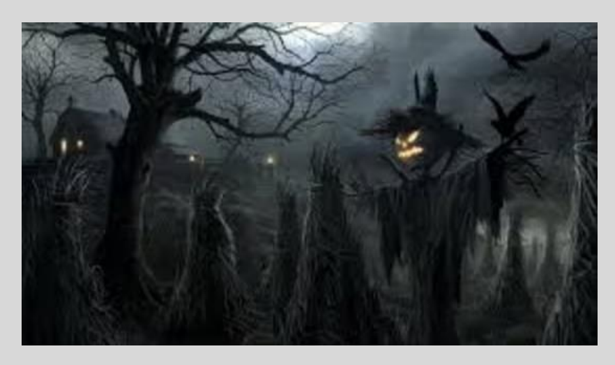
FROM THE VICAR