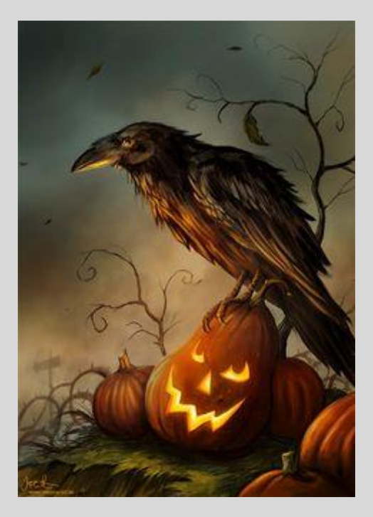
FROM YOUR SENESCHAL