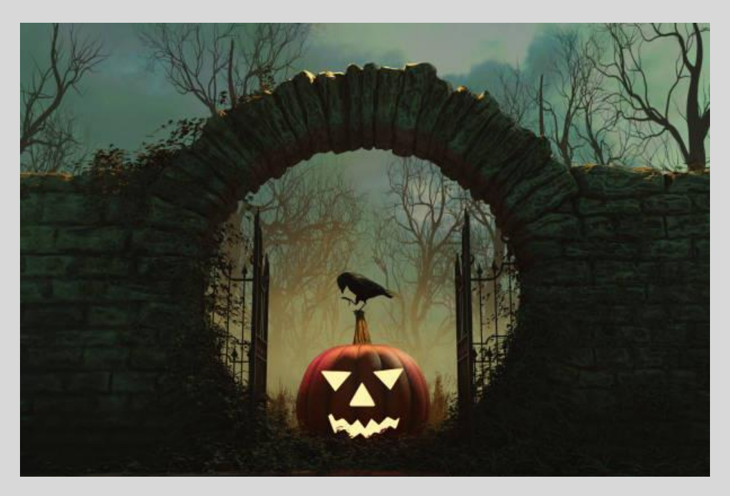
FROM MISTRESS EDAN