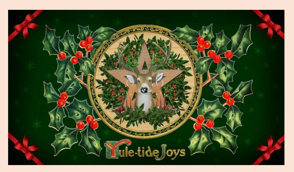
FROM YOUR MINISTER OF ARTS & SCIENCES